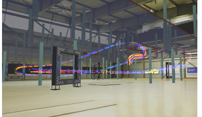
Fig. 1: Our quadrotor executes a near time-optimal multi-waypoint trajectory planned by the proposed method in a racing track with virtual obstacles, reaching speeds over 60km/h. The picture was taken in our large indoor drone-testing arena ( 30 \times 30 \times 8m^3 ) equipped with a motion capture system. The photo was augmented with virtual obstacles simulating a two-floor cluttered environment.

Digital Object Identifier (DOI): see top of this page.